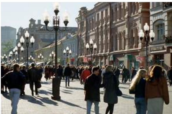
Walking tour on Arbat Street and Metro riding